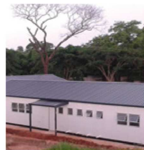
Permanent look & feel