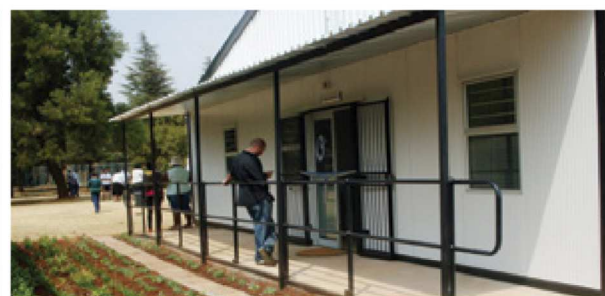
Less expensive than bricks & mortar