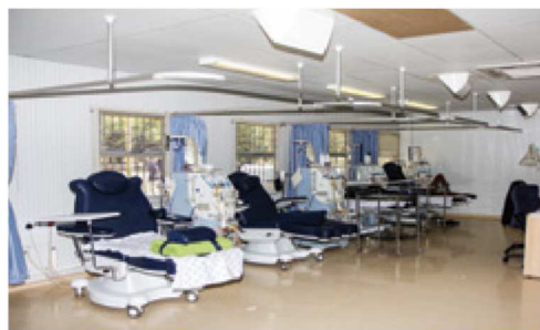
Design to any floor plan