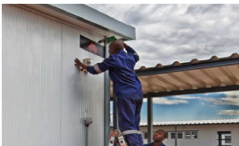
High erection speed